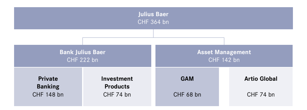
Julius Baer Group: Assets under Management as of 30 June 2008

The Group's organisational structure meets all the demands of modern corporate governance as well as the requirements of efficient management. More than 4 200 employees are available around the clock to serve our clientele. We endeavour to understand our clients' financial needs as well as their private and cultural considerations. There is no substitute for being in close contact with clients. We are at well over 30 locations worldwide and wherever our clients need us to be.